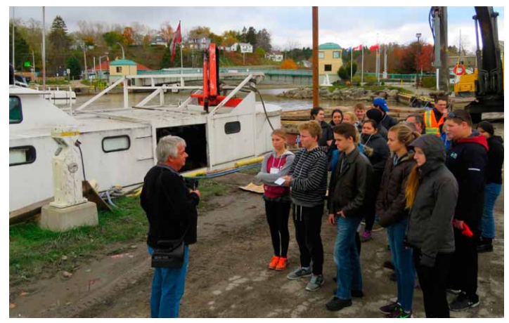
Students talked with a Lake Erie commercial fisherman.

The UTRCA has been providing support and assistance to provincial and federal agencies for over 20 years as they work to restore and protect the health of Lake Erie. In 2015, the UTRCA's Community Partnership unit was involved in two important initiatives. At the request of the Ministry of the Environment and Climate Change (MOECC), and with assistance from other Conservation Authorities (CAs), the UTRCA hosted two Lake Erie Student Conferences. The first was held in Port Dover in May, and the second in Port Stanley in October. Both conferences accommodated close to 100 grade 11 and 12 students.