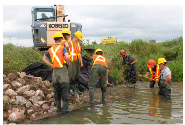
UTRCA staff worked with MNRF Stewardship Youth Rangers to install wooden cover structures along Medway Creek.

Over 300 students from several schools planted approximately 1000 trees and shrubs to create woody buffers. Western University students helped to install live stakes (bioengineering) along the stream through most of this property. Other participants included the Ministry of Natural Resources & Forestry's (MNRF) Stewardship Youth Rangers and the Friends of Medway Creek.