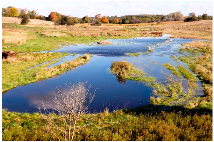
Small wetlands, such as this one restored within a natural wet area in a farm field, offer excellent wildlife habitat and water quality and quantity benefits.