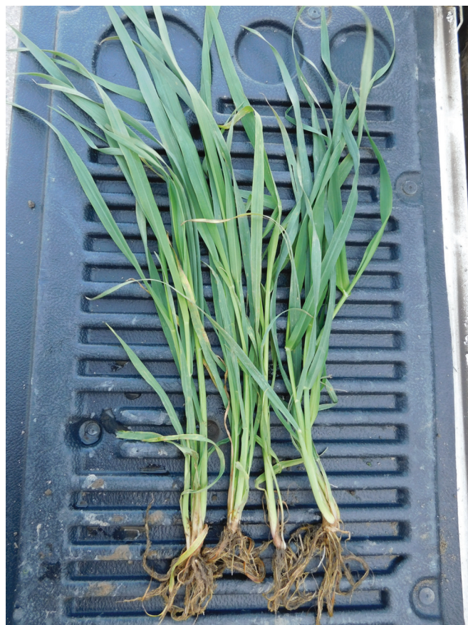
Above and belowground biomass of oat cover before harvest.

Drilling the cover crop seed provides a uniform cover and thick stand due to the increased soil-seed contact in late fall.