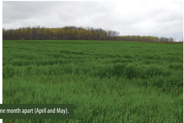
Top growth on cereal rye one month apart (April and May).