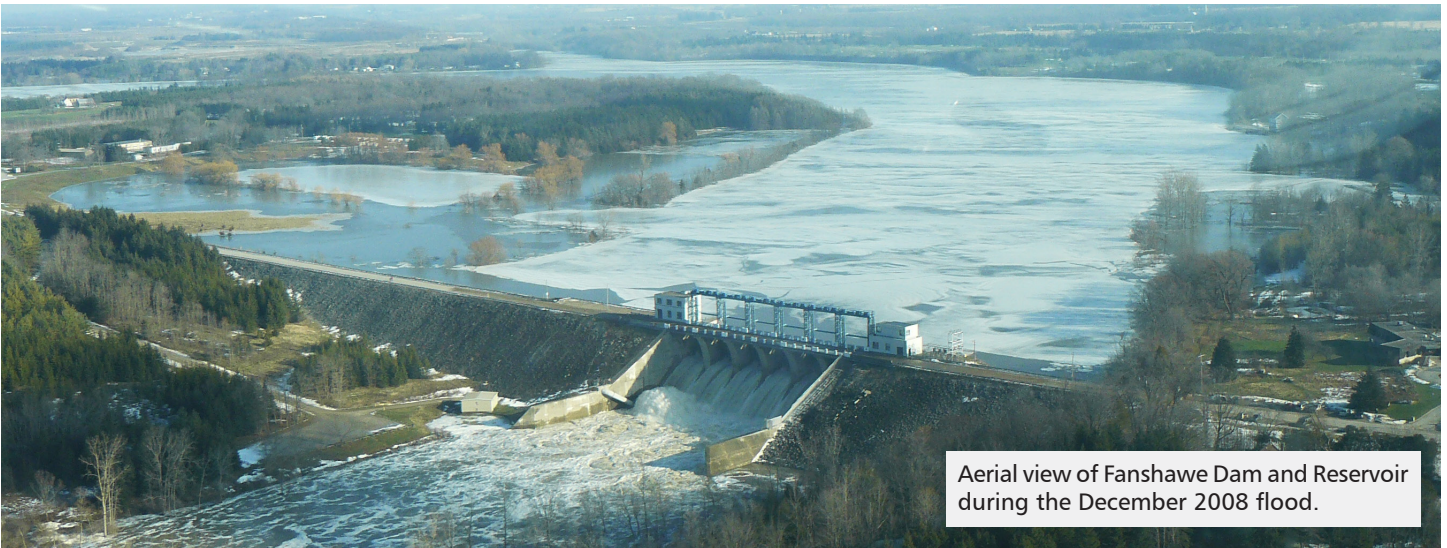
Aerial view of Fanshawe Dam and Reservoir during the December 2008 flood.

The Thames River has been a focus for human activity for centuries. Native peoples and the early European settlers relied on the river as a source of abundant resources and as a corridor for travelling through the forests that covered Southern Ontario. The first settlements along the river were small and transitory, but soon grew to take on a more permanent nature. As human activity near the water increased, it was affected more and more by the seasonal fluctuations of the Thames.