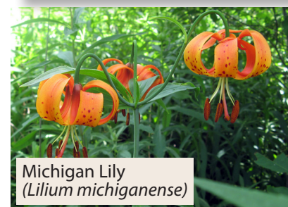
Michigan Lily ( Lilium michiganense )