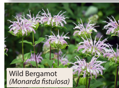
Wild Bergamot ( Monarda fistulosa )