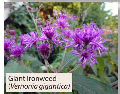
Giant Ironweed ( Vernonia gigantea )