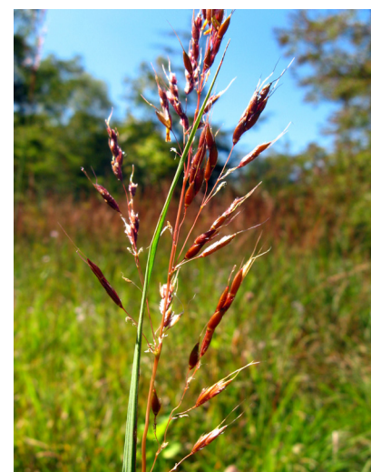
Yellow Indiangrass (Savanna Grass) ( Sorghastrum nutans )