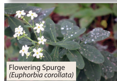
Flowering Spurge ( Euphorbia corollata )