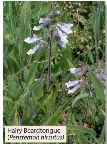
Hairy Beardtongue ( Penstemon hirsutus )