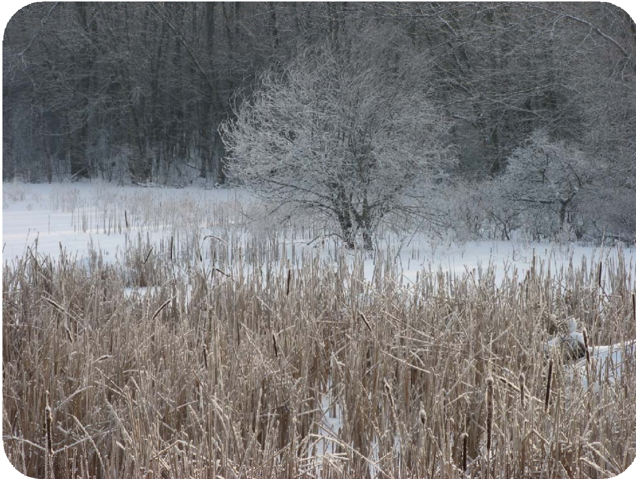
Cathy Quinlan, Terrestrial Biologist, UTRCA October 2012