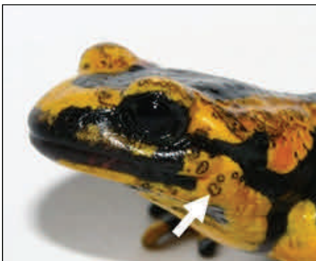
Fire salamander with lesions on its face.